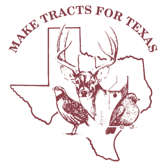
Texas Parks and Wildlife 4200 Smith School Road Austin, Texas 78744

Bulk Rate U. S. Postage Paid Austin, Texas Permit No. 2270